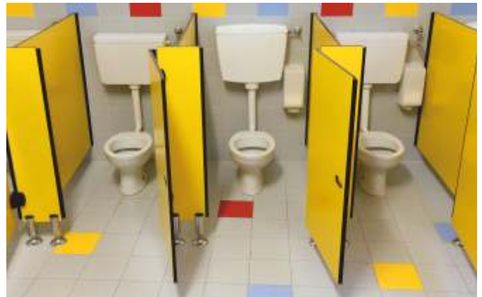
Vibrant children's range