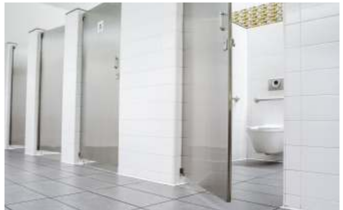
Elegant range for female restrooms