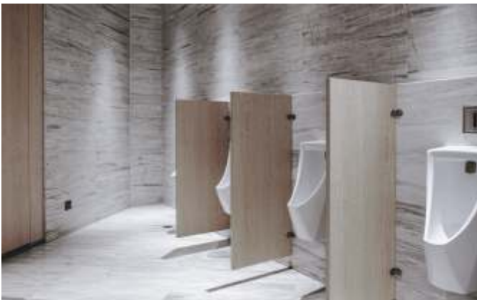
Smart separators for male restrooms