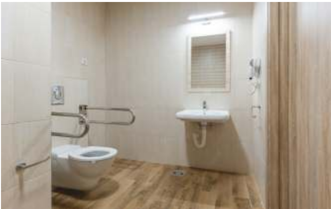
Dependable range for the physically challenged

Our Cubicle Restroom Systems come in a wide range of colour and finishes, providing the ideal solution to varied requirements. From ultra-modern and germ free stainless steel cubicles, colourful cubicles for kids, elegant cubicles for male and female restrooms and even specialized cubicles designed for the physically challenged, you can meet all your design needs with SIOF.