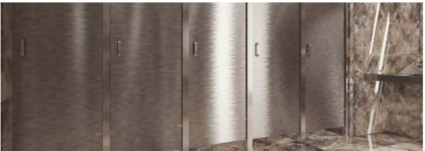
Sleek stainless steel range