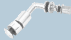
SIO four-way spider to canopy glass connector with articulated bolt