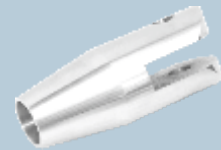
SIO Rod connector