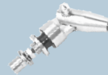
SIO two-way spider to rod connector