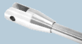
SIO Rod assembly