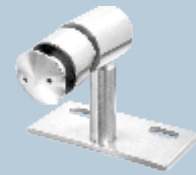
SIO one way wall-to-glass connector with articulated bolt