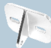
SIO Wall-to-rod connector