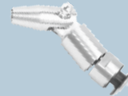
SIO Rod to canopy glass connector with articulated bolt