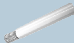
SIO Canopy rod